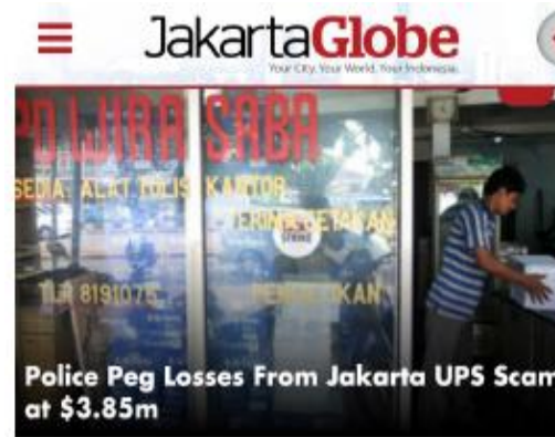
Police Peg Losses From Jakarta UPS Scam at $3.85m

Jakarta. Police say they have found indications of state losses amounting to at least Rp 50 billion ($3.85 million) in last year's procurement of uninterruptible power supply equipment for schools in Jakarta.