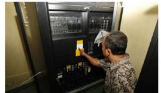
TEMPO.CO, Jakarta - The Corruption Directorate of Criminal Detective (Bareskrim) of National Police examines